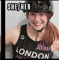
BEASTIE NOISE 212