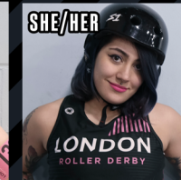
TROPIC ATTACK 94