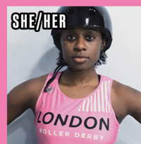
CAMER RATTATTACK 237