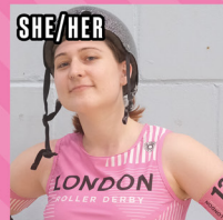
TEXAS HEAT 1393