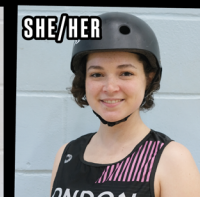
KATPISS NEVERCLEAN 2