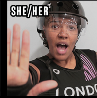
AMAZING DISGRACE 088