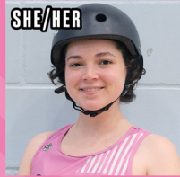
KATPISS NEVERCLEAN 2