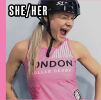
PARTY PANTS 08