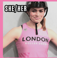
DELTA STRIKE 4