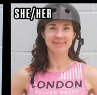
MAX VOLTAGE 240