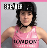
ALLEY CAT 27