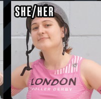
TEXAS HEAT 1393