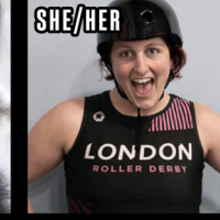
HIPPY HIPPY SKATE 64