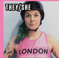
WU-TANG JAM 36